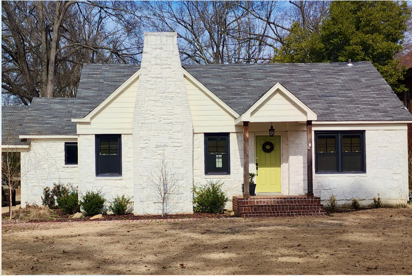
(Above) Oxford House Bella Grace.