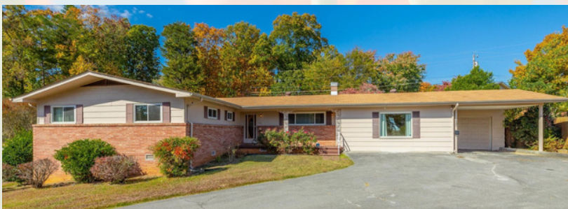
(Below) (Top) Oxford House Comet Trail. (Bottom) Oxford House Fox Trail - fully handicap accessible.